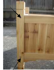
Fig. 2. Insert Bolts