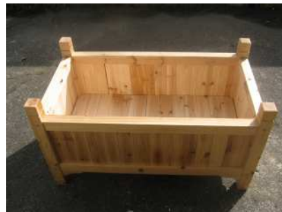
Fig 4. Bottom fitted in and completed

2. After setting up the main frame, use the cedar bottom piece (Or 2 if you purchased a rectangular model) to install the bottom of the planter as shown in Fig. 4. For stronger support, you can staple, nail, or screw the bottom in if necessary.