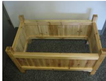
Fig. 3 Four sides completed

2. After setting up the main frame, use the cedar bottom piece (Or 2 if you purchased a rectangular model) to install the bottom of the planter as shown in Fig. 4. For stronger support, you can staple, nail, or screw the bottom in if necessary.